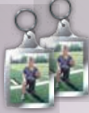
PACKAGE H7 2 Key Chains $13