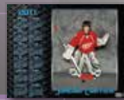
PACKAGE H1 8"x 10" Calendar $15