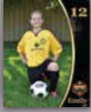
PACKAGE H2 8"x 10" Classic $15