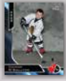
PACKAGE H3 8"x 10" Blue Metal $15