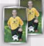
PACKAGE H8 2 Photo Magnets $13